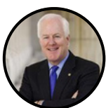
Sen. John Cornyn