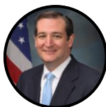
Sen. Ted Cruz