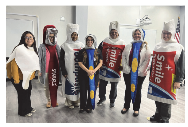
UTHealth Houston hosted a workshop to inform health professionals of the importance of oral health and regular dental care for adults with DD.

The University of Texas Health Science Center at Houston developed an innovative training program in collaborative care for people with DD at dental and medical schools across Texas. The project engaged dentists to work with a team of professionals from the health care, dental care, and behavioral health fields. TCDD supported this work to give health care and dental care professionals a deeper understanding of how discrimination in health equity impacts people with DD. The initiative included additional projects coordinated by Baylor College of Medicine and the University of Houston-Clear Lake.