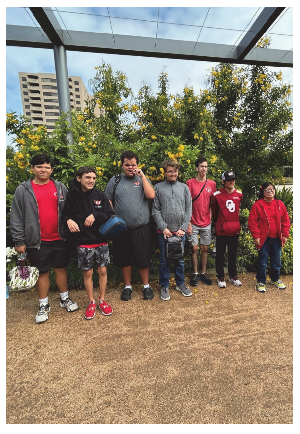
Students with DD from the HUB Houston joined disability community coordinators, master gardeners, and the Harris County Extension horticulture agent for an inclusive gardening tour at the Houston Centennial Garden. The HUB plans to design a sensory garden of its own in the future.

Meaningful connection develops by creating different ways for people with DD to engage with us and also with each other. This goes from presentations to large audiences at state and national conferences all the way down to local "platicas" meetings that bring neighbors together to solve language barriers and make sure Spanish-speaking families have access to important disability resources.