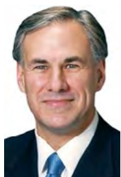
Gov. Greg Abbott

ALL BILLS MUST PASS THROUGH THE SENATE & THE HOUSE TO BECOME LAW